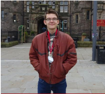
Lyndon Engineering (2019) Edinburgh

Students have gained top grades in recent years, progressing to University level study at prestigious Universities