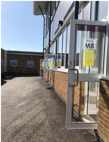
Classrooms accessed using outside doors where present.