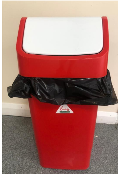
'Catch it, bin it, kill it' lidded bins across the site; 250 of them.

As with all plans of this scale we have come across some issues this week which we have dealt with quickly. We are aware that younger students are finding it difficult to get through the canteen and eat their food within the half an hour. We should have provided them with more information in advance so that they could make some decisions about what they might want to select before getting to the queue; this we have now done. We have taken a relaxed approach however, in allowing them the time to eat their food before going to their lessons.