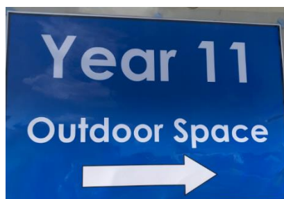
Signs indicating areas for different year group 'Bubbles'

Like all schools and work places at the moment, we have put a lot of effort into planning for the full return. I thought it might be useful to provide you with some visuals to illustrate just a few of the new measures your child will have seen around the school this week.