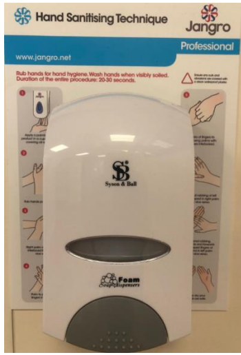
Hand sanitisers in every room. Over 200 across the site.