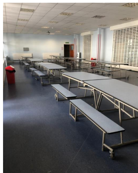
Eating space for Year 8 only

We were unable to put picnic benches in the Year 8 outside area as it is a fire evacuation point and so this made it difficult for them to eat their food. We have now provided this year group with their own designated eating space inside the school. They can of course still go outside to eat if they prefer.